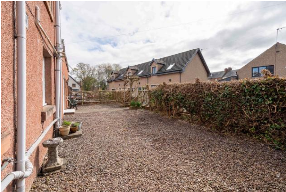
Carra Cottage Railway Court, Newtown Street, Boswells, TD6 0PW

Approx. Gross Internal Area: 1614.59 Sq Ft (150 Sq M)